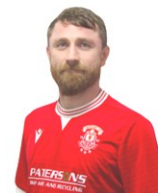
Seeking a sponsor