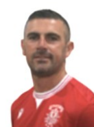
RC DANCE COMPANY