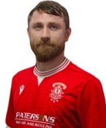
Seeking a sponsor