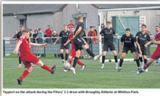
Tayport on the attack during the Filers' 3-1 draw with Broughty Athletic at Whitton Park.

With no senior games in the city last Saturday, the Evening Tele devoted a bit more space to tier 6 on Monday. The picture's caption read 'Tayport on the attack...' but the pic clearly shows Broughty on the offensive with seven 'Port players successfully defending their goal.