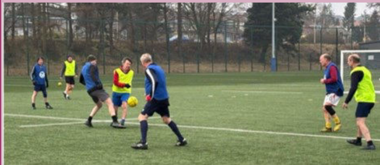
Friday morning training at Caird Park

For this tournament we have entered our over 60s group, a first for us.