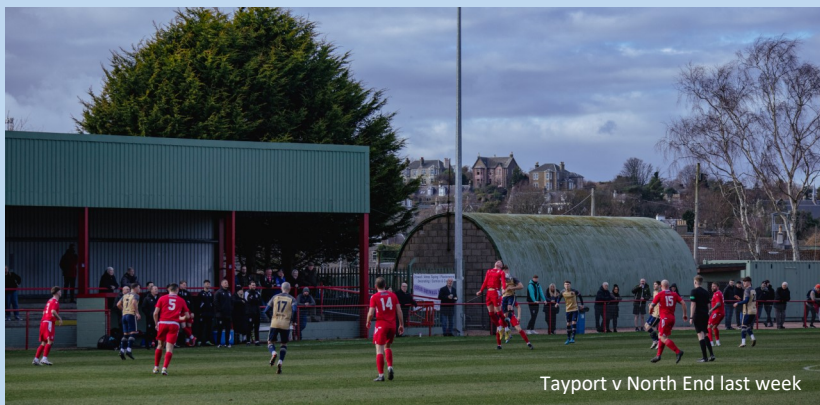
Tayport v North End last week