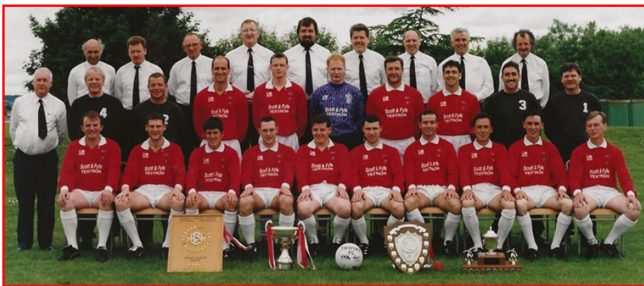
Tayport FC 1994/95