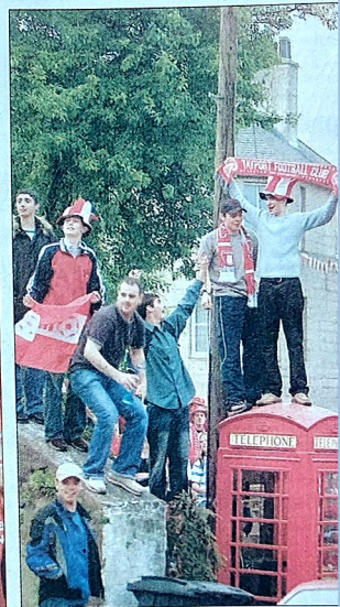
Any vantage point will do to get a good view of the returning heroes.

The Courier of Monday 2nd June 2003 reports the return to the town of the conquering heroes after the Scottish Cup win over Linlithgow Rose the previous day. Note: the occasion was covered on the front page and also on another four page of the paper. Can't see imagine coverage to that extent like in The Courier of the modern era..