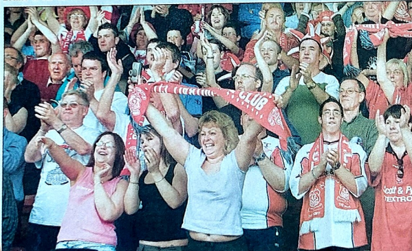
Fans celebrate at the end of the game.

See also Pages 1, 18 and 20 and comment on Page 10.