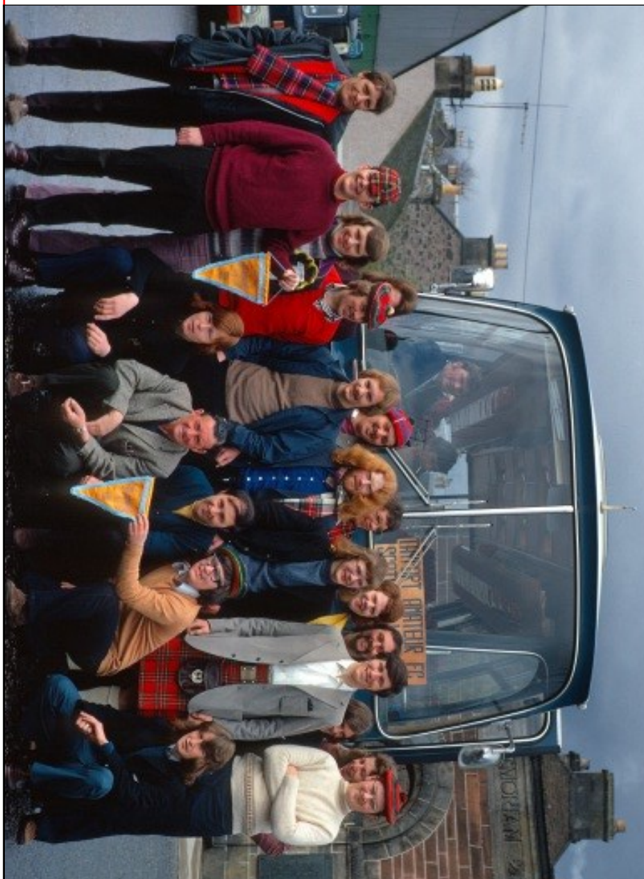
Tayport FC in Europe 50 years ago - for details see over