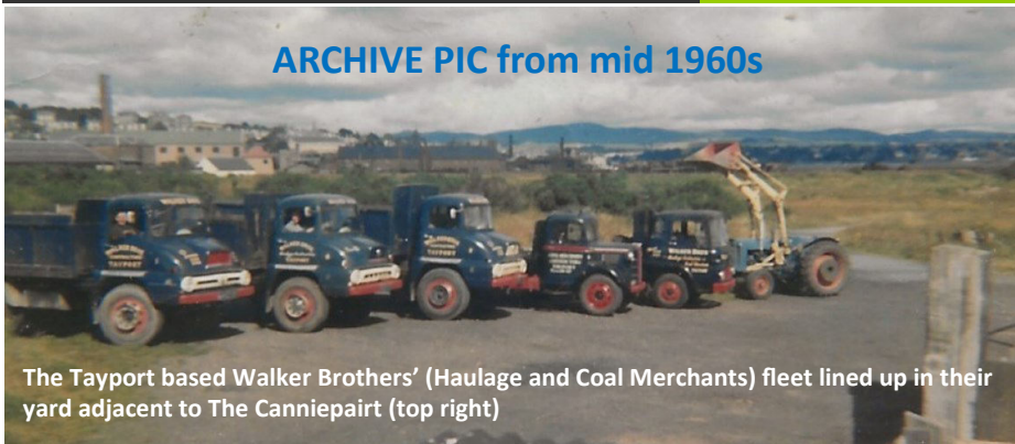
The Tayport based Walker Brothers' (Haulage and Coal Merchants) fleet lined up in their yard adjacent to The Canniepairt (top right)