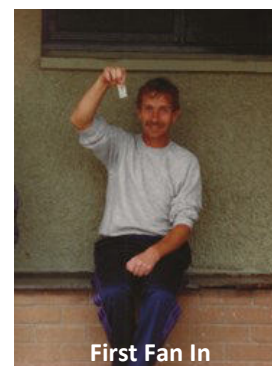
First Fan In