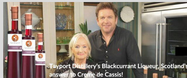
Tayport Distillery's Blackcurrant Liqueur, Scotland's answer to Creme de Cassis!

Our Programme back page advertisers and next door neighbours, TAYPORT DISTILLERS , received a great boost recently when their wonderful Blackcurrant Liqueur featured on ITV's JAMES MARTIN'S SATURDAY MORNING show