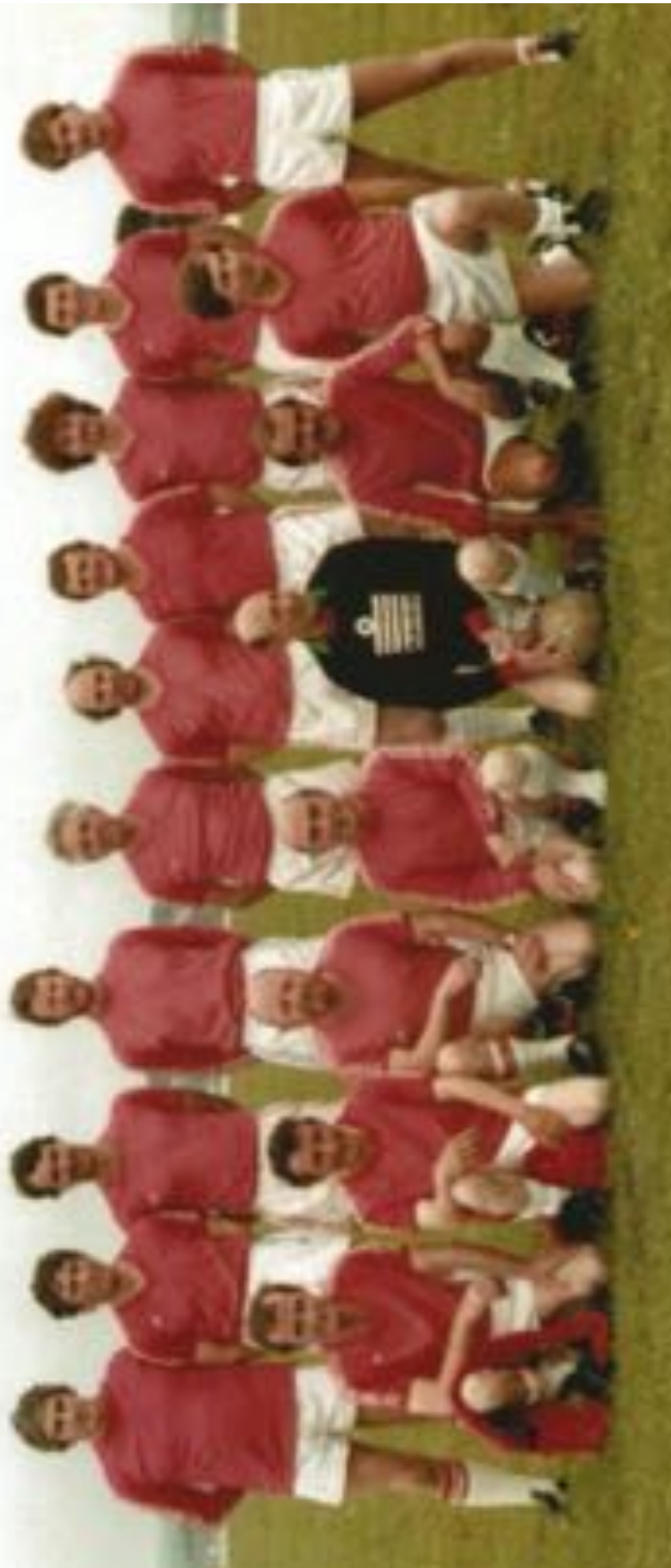
A pic from a Tayport FC Gala Weekend in 1984 shows the Tayport Veterans' line up.