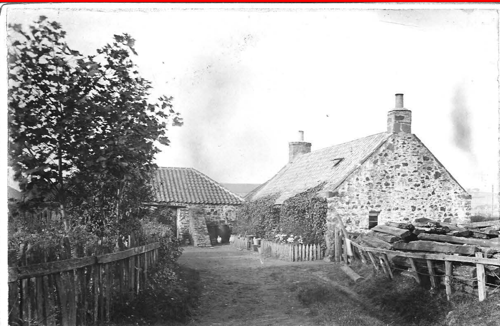
The Canniepairt Farmhouse and Dairy late 1800s. Situated on the present pitch, approximately in the vicinity of the away dugout. Photo taken from the east on the access road looking west across the pitch towards the enclosure which is situated bang in the middle of what was the Edinburgh to Dundee railway line.

Players & fans weren't just tough in the old days...they could also see in the dark as this report from a match played in Tayport 132 years ago would suggest