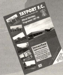
The Tayport programme for that last meeting between the Port and the Rose on 14th February 1998