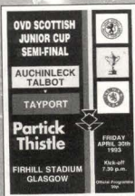
The programme for Tayport's first appearance at this stage was just nine years ago.

It wasn't until the following year that Tayport even entered the competition, having only just been accepted into the Junior ranks twelve years ago. However, they have certainly made up for lost time by making their fourth appearance at the penultimate stage this evening. Making their record even more remarkable for such a fledgling club, they have won on all three of their previous visitations. Auchinleck, as already mentioned, have twice been their victims.