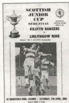
The programme for Linlithgow's first ever semi-final appearance 37 years ago.

Both of the other semi-finalists have rather more recent memories of Junior Cup glory. Although Linlithgow have appeared in four previous semis, they are tonight breaking new ground, having previously played all of the penultimate ties at Brockville. It is now some 37 years since they beat Baillieston 4-1 to lift the trophy, after defeating Kilsyth Rangers 1-0 in what was their first ever semi-final appearance.