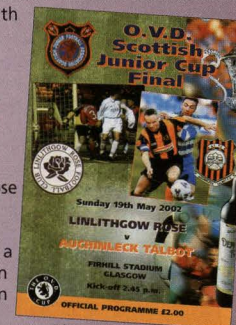
The programme for Linlithgow's Cup triumph last year.

Some 6,966 saw Rose collect the trophy that they are now looking to retain – a feat that in modern times has only been achieved by Cambuslang Rangers in the seventies; and Auchinleck in the eighties and early nineties; and now Rose hope to join that elite band.