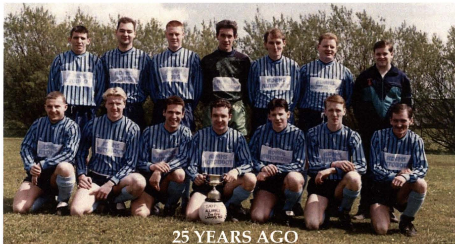
25 YEARS AGO