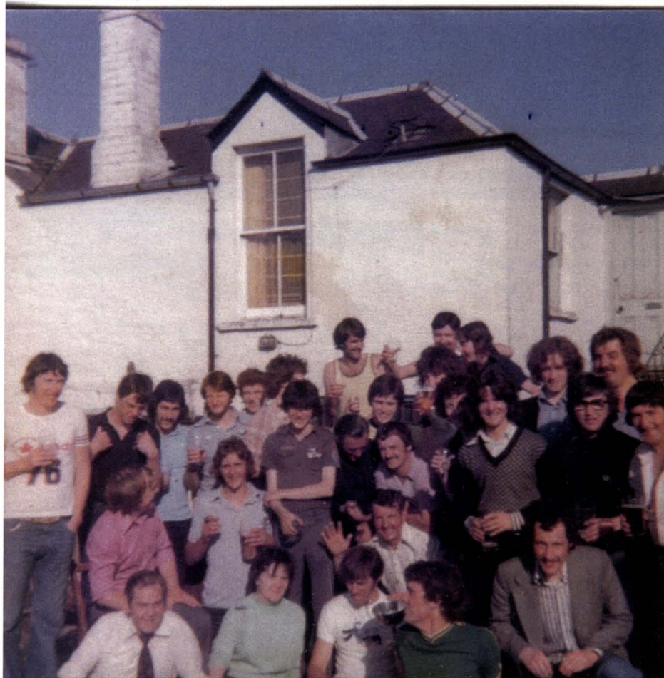
Tayport FC - Alliance Cup Winners Forty Years Ago Sat. 29 May 1977