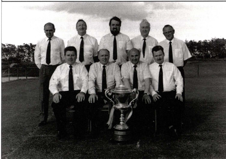
The Tayport FC committee members pictured at The Canniepairt in 1996 with the first of the club's three Scottish Junior Cups.