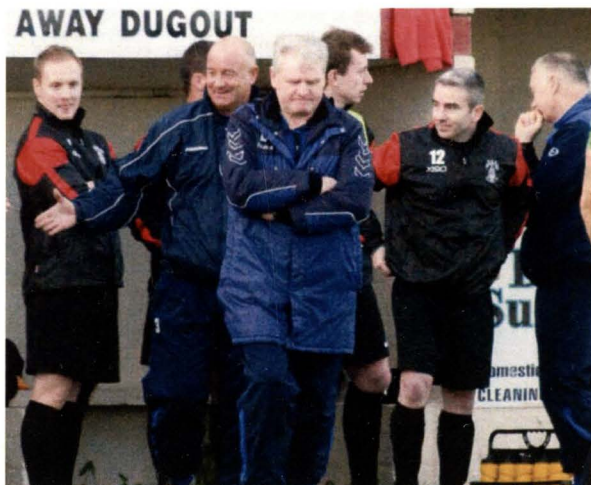
The Boss reflects on another job well done.