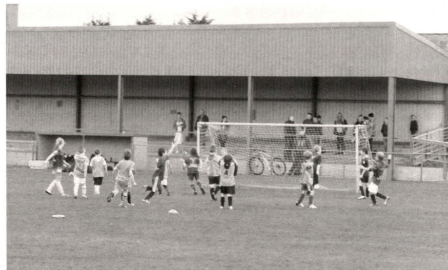
Sessions Resume Spring 2016