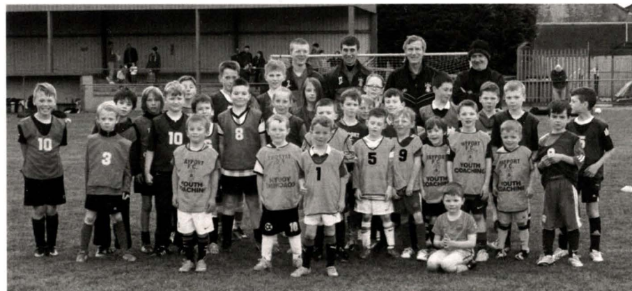
Happy Faces At A Saturday Morning Session