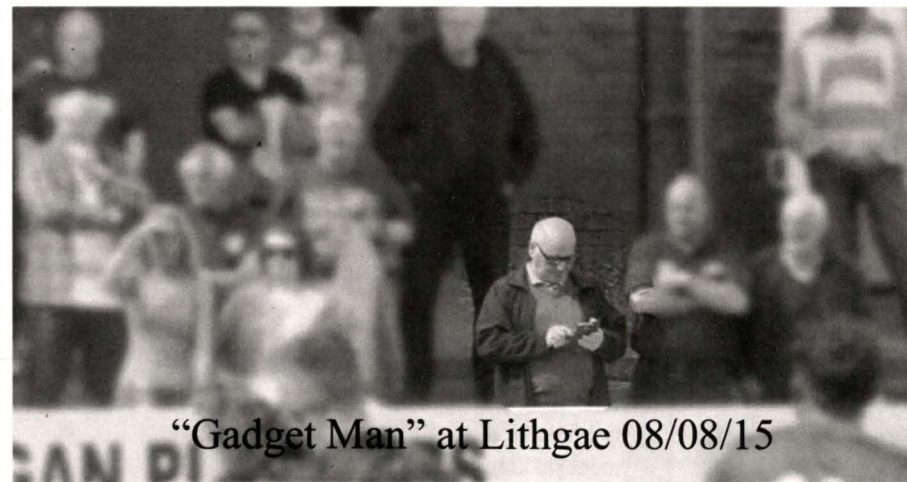
"Gadget Man" at Lithgae 08/08/15

Tayport FC Final Car Boot Sale for this year will take place on the Canniepairt this Sunday 4th October 2015.