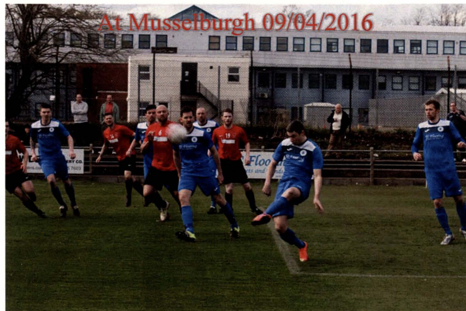
Musselburgh clear an early corner .