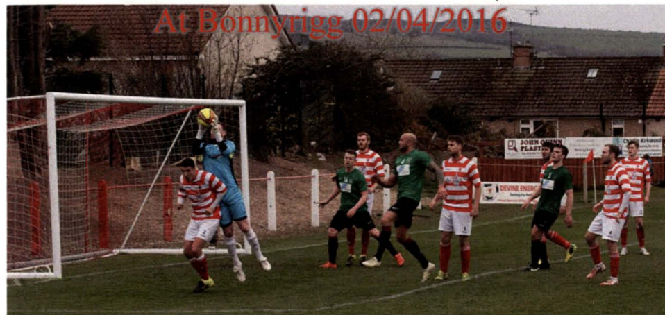
Late Pressure from Tayport.