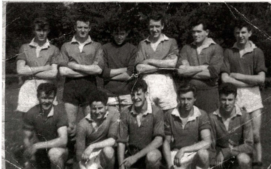
Tayport FC Alliance X1 pictured on East Common. The photo is thought to date back circa 54 or 55 years.