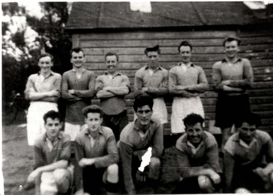
Tayport FC's Alliance XI pictured in front of their changing hut on East Common in season 1959/60.