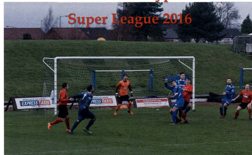
Tayport Threaten Bo'Ness goal early on!