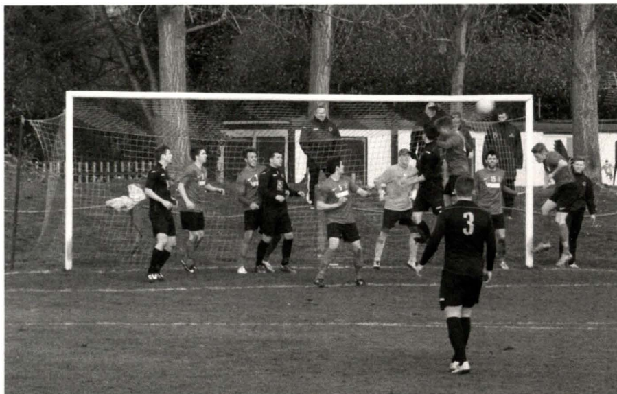
Tayport under pressure from wind assisted corner!