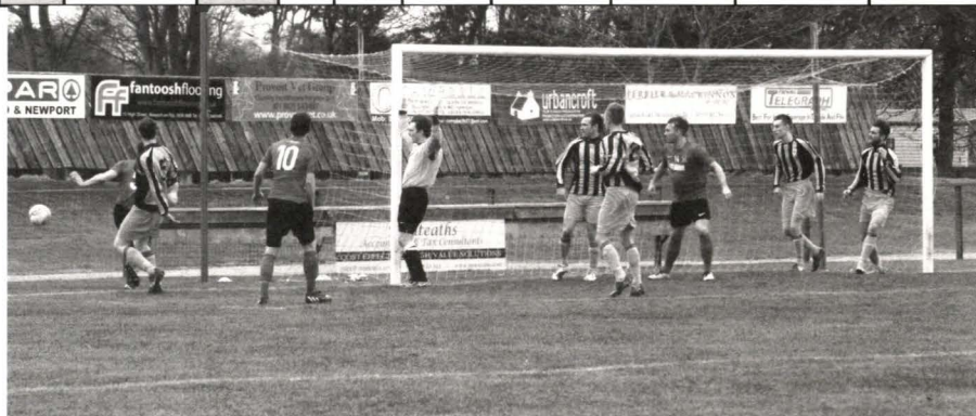
Photo from last week's game against Jeanfield