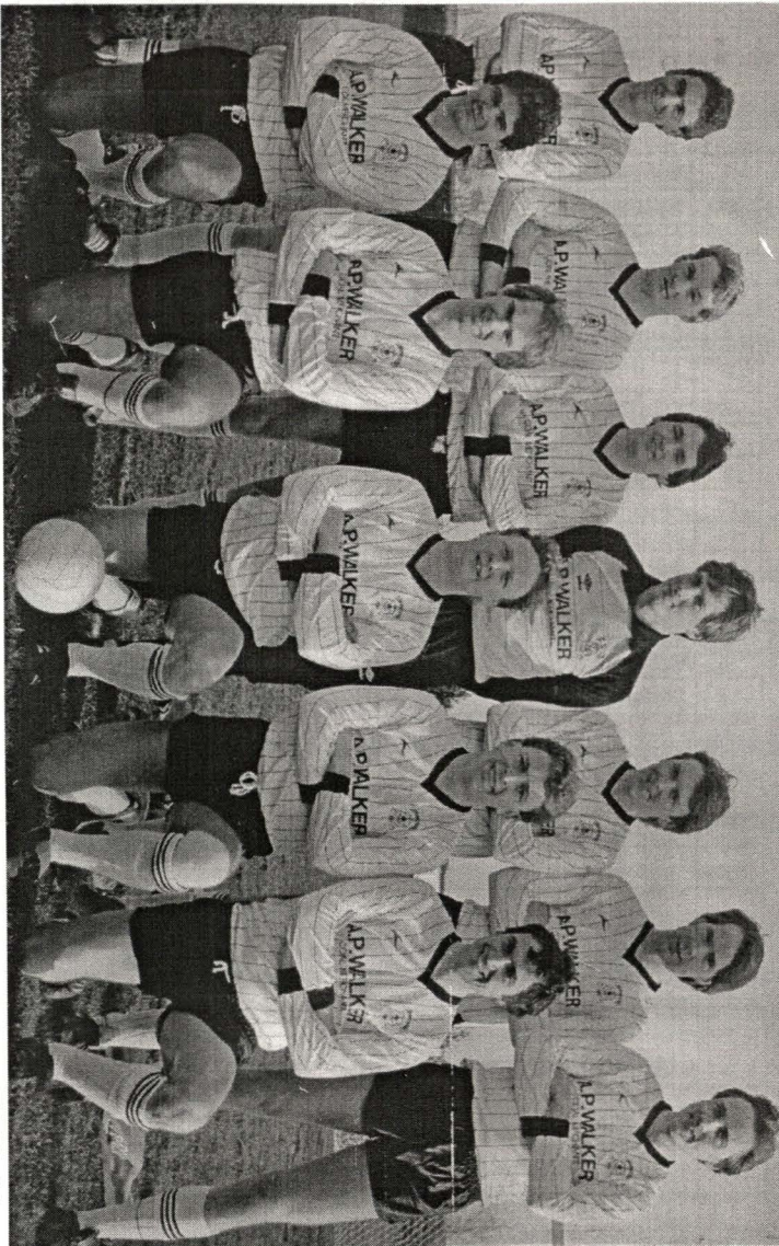
Archive Photo from 29 years ago