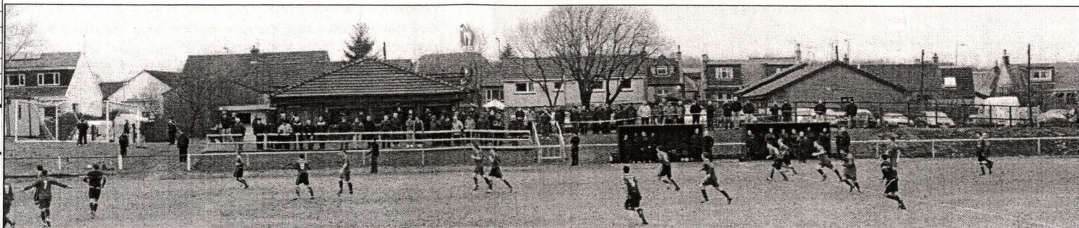
New look Creamery Park, Bathgate