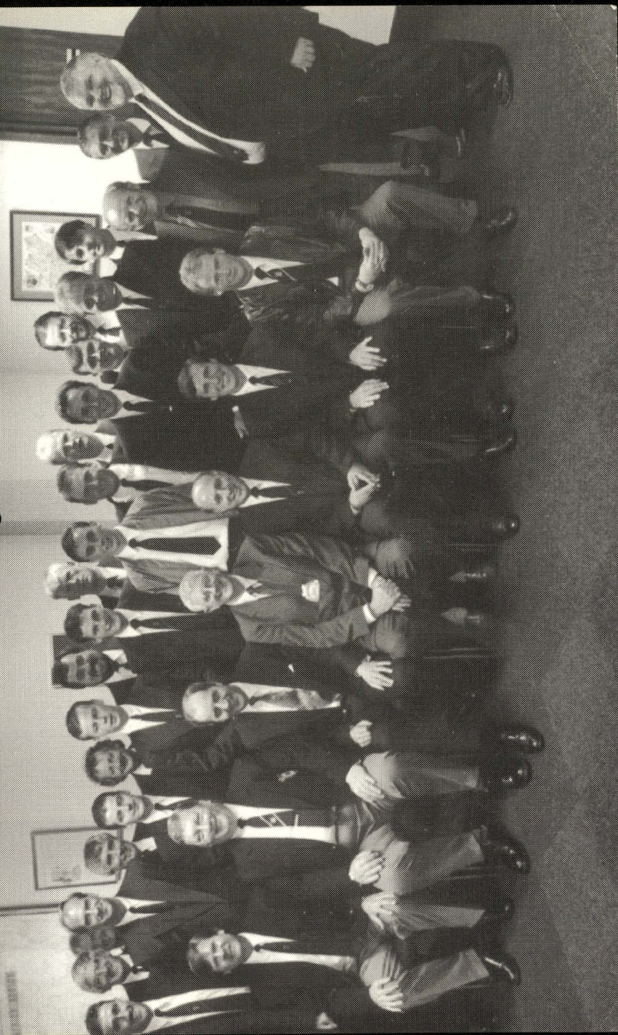
Tayport F.C. players, officials and sponsors and Tayside J.F.A officials at a reception hosted by Tayside Regional Council at Tayside House in recognition of the club's achievement in reaching the final of the Scottish Junior Cup