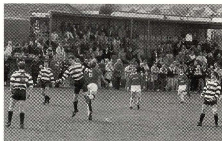
Action from the match v Downfield

— from "Scotland on Sunday's" Sports Diary 10/5/92