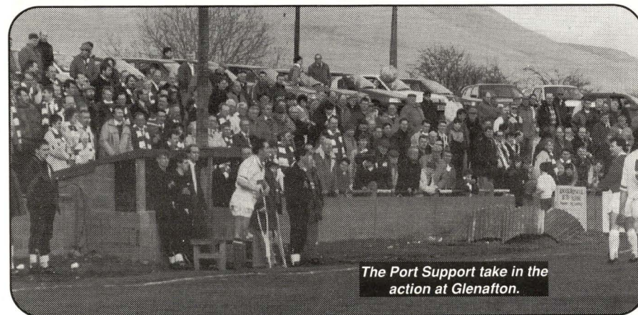
The Port Support take in the action at Glenafton.